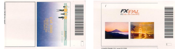
Figure 1: Palette Cards: tangible interfaces to digital materials

The Palette facilitates the showing and sharing of digital presentation materials [3]. The Palette software formats and prints a card for each slide in a digital presentation (Figure 1), and these act as tangible interfaces to the digital slides. Swiping the cards under a barcode reader brings up the appropriate slide (Figure 2). The user need not explicitly search for the file and the specific slide, thus saving time and avoiding fumbling in front of the audience.